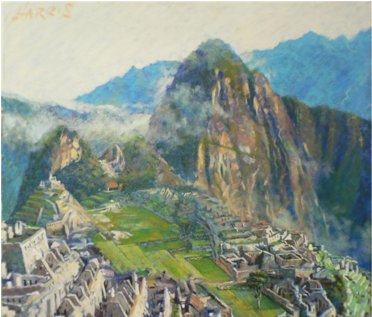
Rolf Harris's Picture of Machu Picchu

We leave 14 th May and will get back 4 th June as we will stop off for some R & R with family who live in the USA."