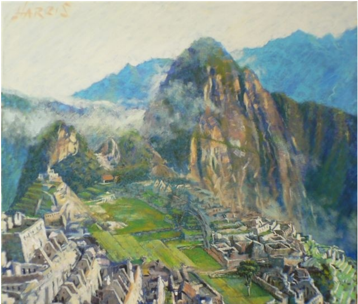
Rolf Harris's Picture of Machu Picchu

We leave 14 th May and will get back 4 th June as we will stop off for some R & R with family who live in the USA."