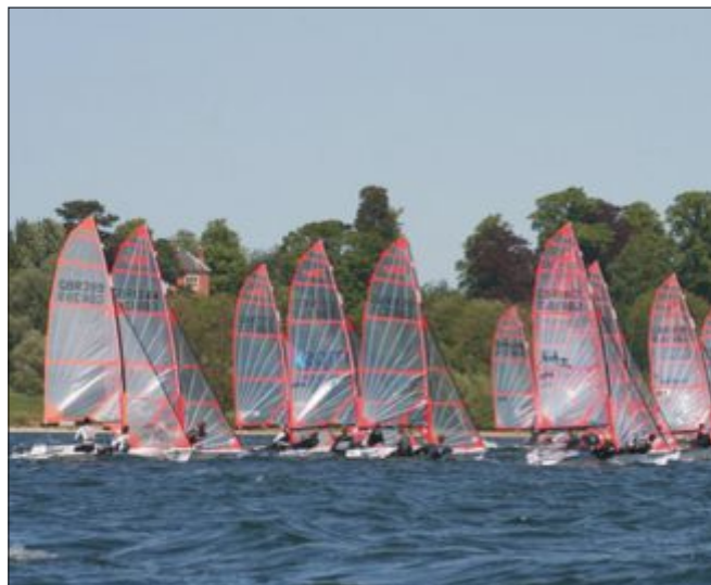
29ers are ready to roll.