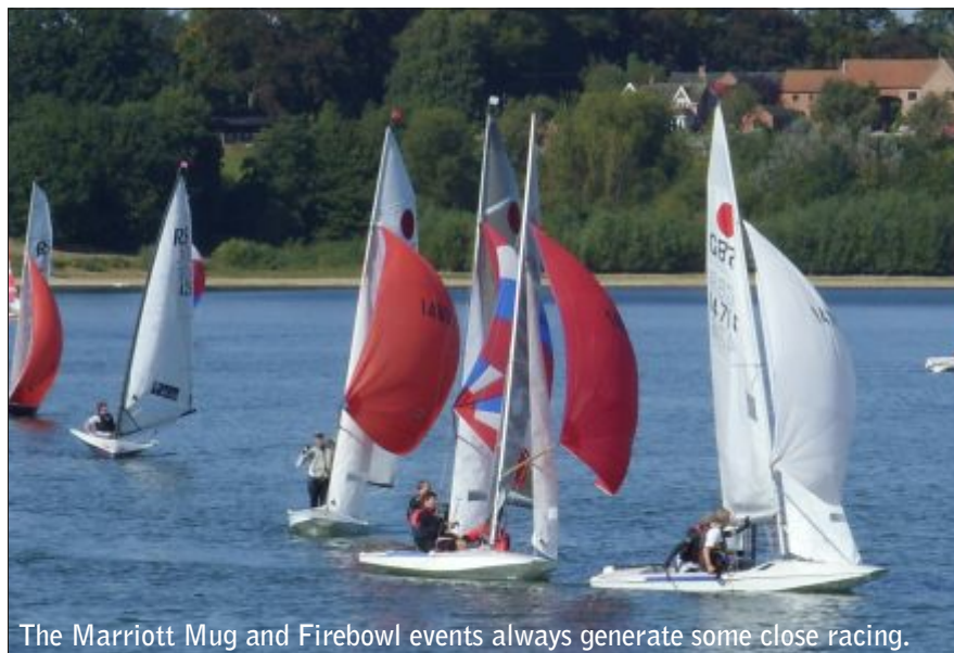
The Marriott Mug and Firebowl events always generate some close racing.

Top tip: Hire one of the club boats or Onboard's training boats and join in.